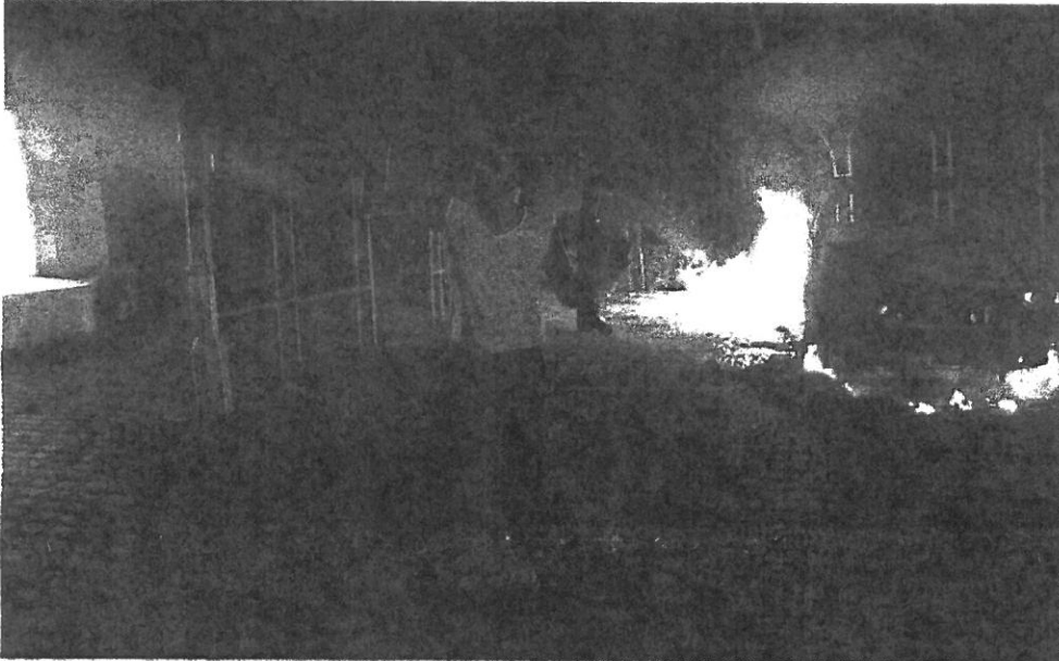
A man waves a rifle as buildings and cars burn inside the U.S. consulate compound in Benghazi on Sept. 11, 2012. House Republicans and Democrats furiously traded charges at a hearing on the attack Wednesday.