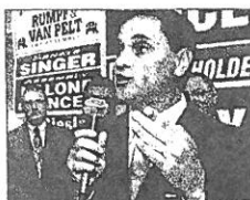
Nov. 6, 2007