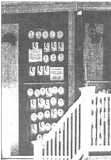
Academy officials said the doors to the school's prekindergarten and kindergarten programs would remain open.