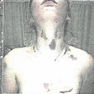
These bruises were found on the body of a Stockton University sex assault victim after she regained consciousness.