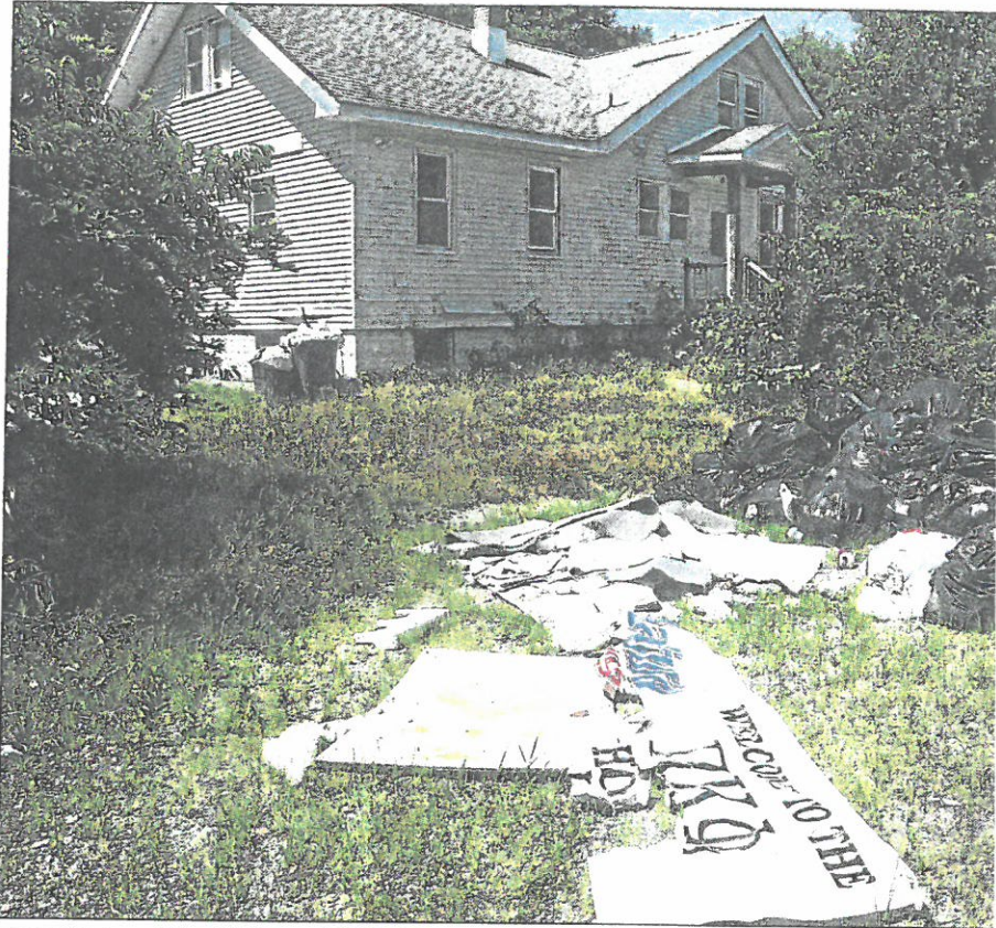
The exterior of the Pi Kappa Phi frat house in Egg Harbor City.