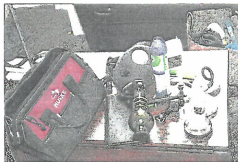
This drug paraphernalia was found inside a Pi Kappa Phi frat house near Stockton University.