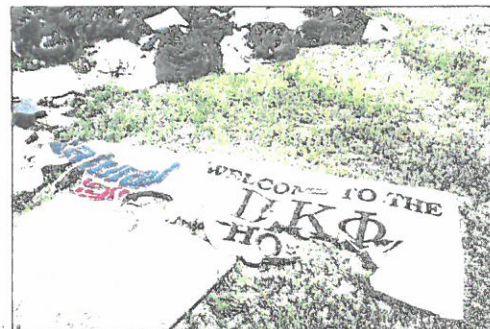
This Pi Kappa Phi banner was found in the trash outside of an abandoned frat house near Stockton University.